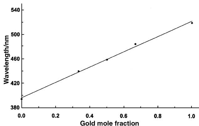
Fig. 2 Absorption position of the surface plasmon maximum as a function of the gold mole fraction.

irradiation. We also found that a lower laser fluence required a longer irradiation time to form gold–silver alloys.